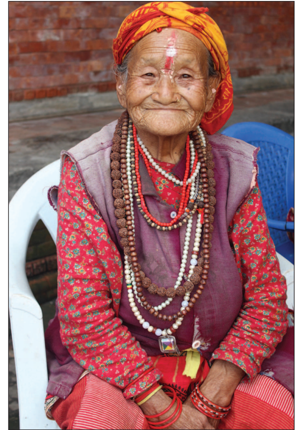
Treatments for elders who have no home or family