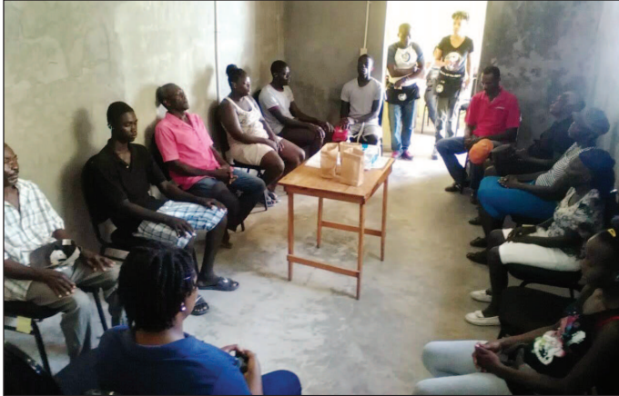
Training at CapraCare, 2017