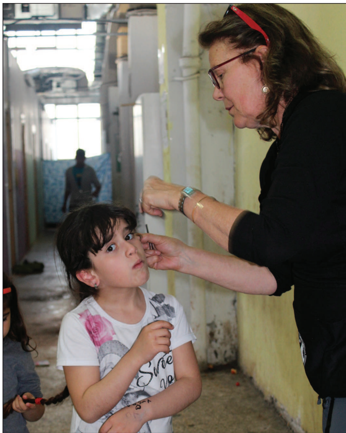
Ear seed treatments at Oinyfyta refugee camp