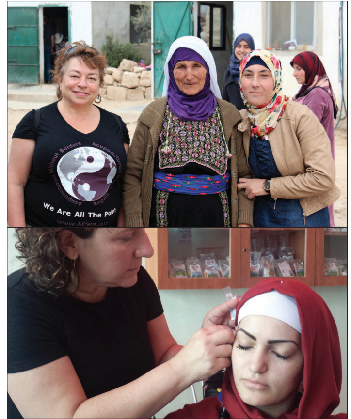
AWB mobile clinic treatments in Jenba, West Bank and East Jerusalem

AWB returned to Israel in October to assist with another training for Israelis, and to solidify plans for training Palestinian health workers next spring.